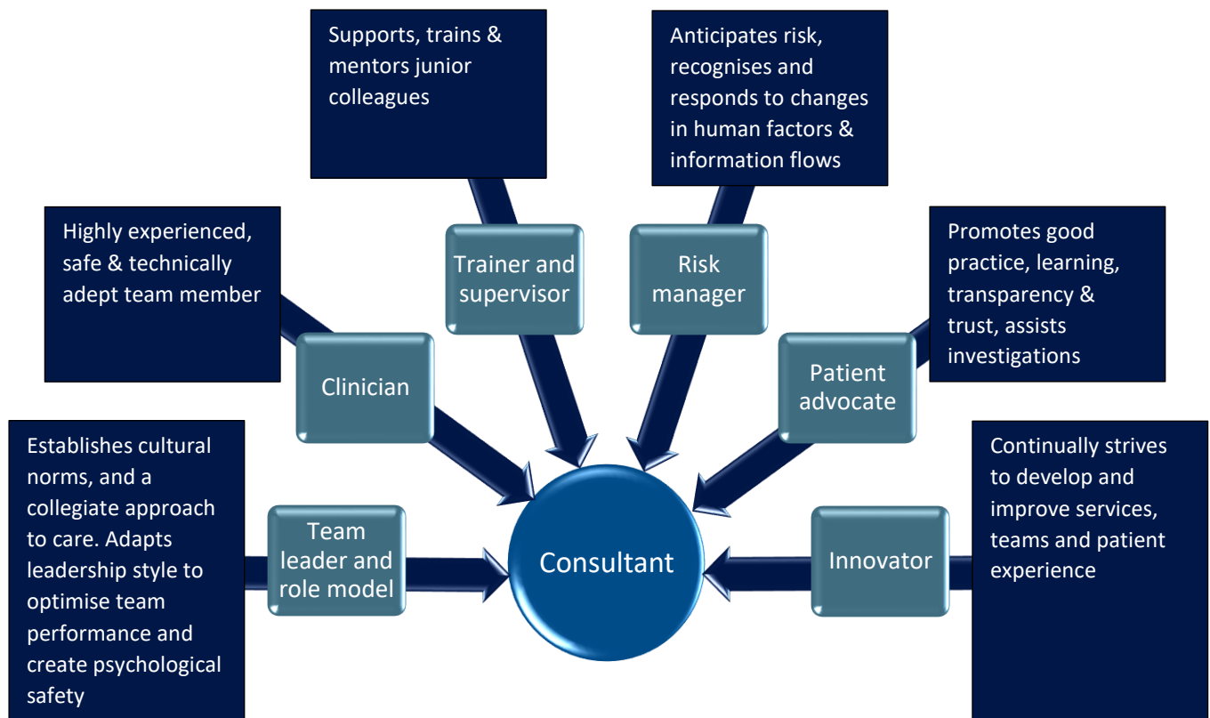
Figure 1. Roles and responsibilities of an O&G consultant

Many O&G consultants have diverse clinical and non-clinical roles both within and outside of the NHS. However, the core roles and responsibilities of the consultant can be broadly summarised as follows: