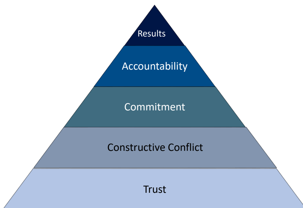
Figure 4. Lencioni’s 5 behaviours of a cohesive team

Lencioni’s pyramid of teamworking provides an accessible model outlining how trust, respectful challenge, commitment and accountability are key factors in successful team working.